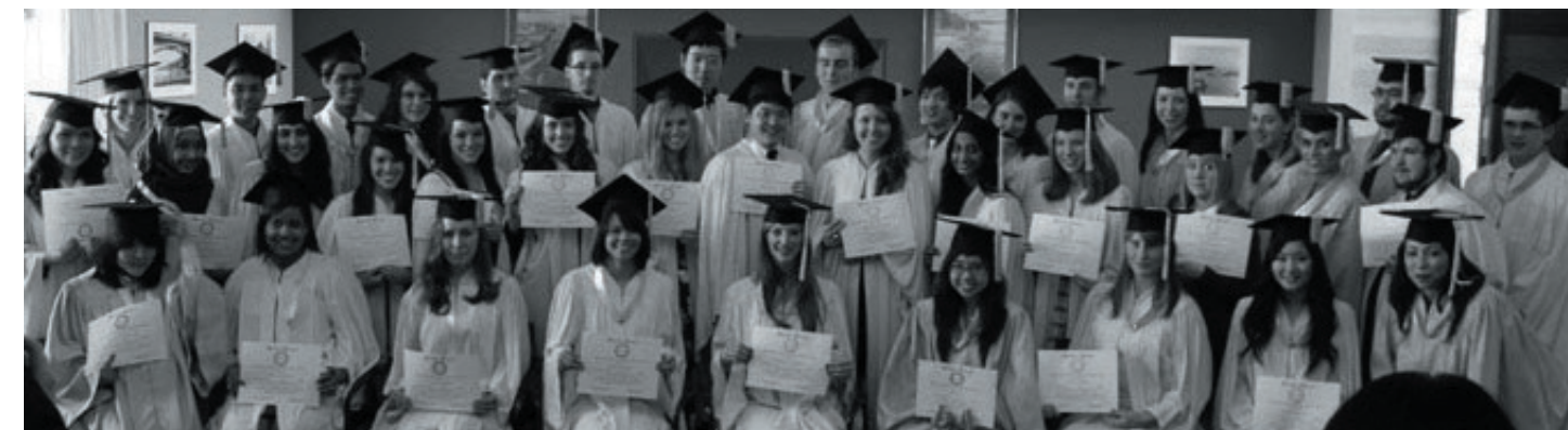
Mortar Board initiation, Tolo Class of 2013

Greetings from Tolo Chapter, Class of 2013! It is my pleasure to let you know what we have done, and will do, this year.