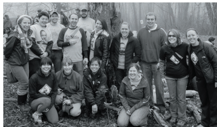
Tolo Chapter members clear invasive species of plants at a Seattle park.

Alumni and actives are welcome to donate to this “forever fund.” Additional gifts will grow the principal, making the annual distribution to Tolo Chapter greater each year. Gifts are made to the Mortar Board National Foundation.