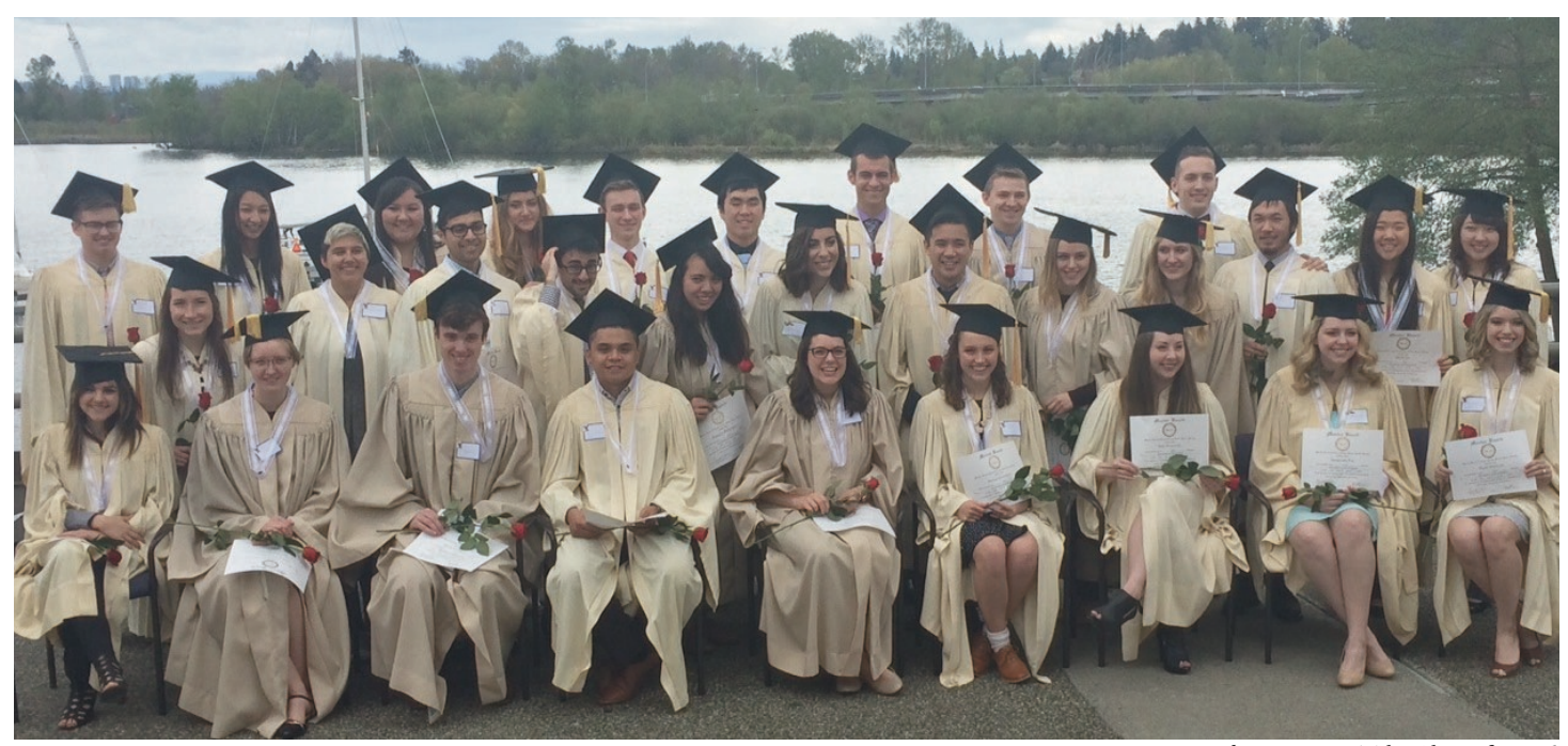
Mortar Board initiation, Tolo Class of 2016