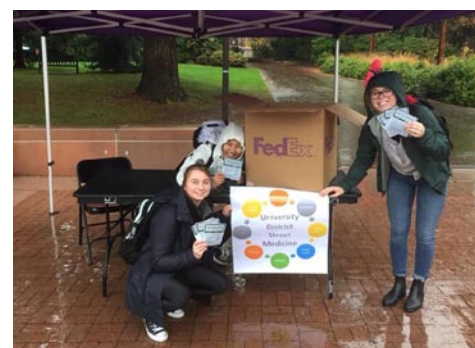
Despite the rain, Tolo members held a weeklong supply drive for University District Street Medicine