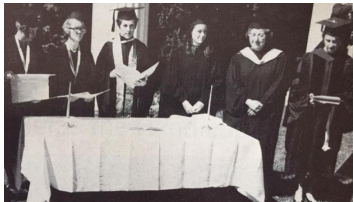
Initiation of the Tolo Class of 1969.

Since their Mortar Board year, members of the Golden Class of 1969 have achieved a very distinguished record of scholarship, leadership, and service to their professions and to the region and beyond. We will celebrate this outstanding class at the Annual Meeting and Brunch on Saturday, April 27.